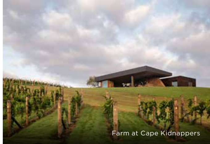
Farm at Cape Kidnappers