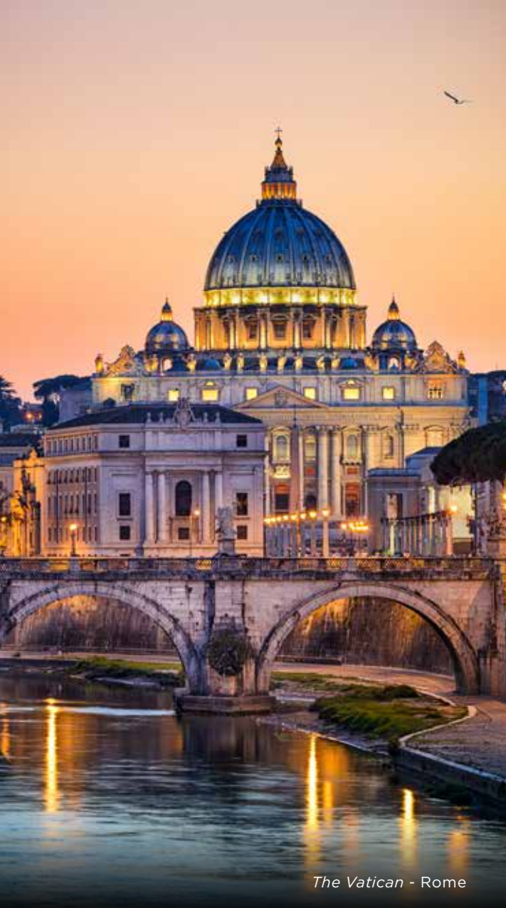
The Vatican - Rome