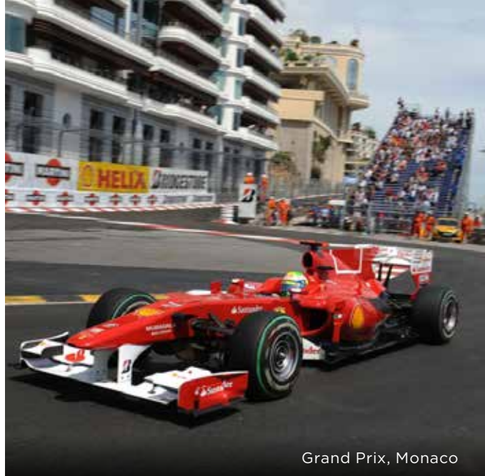
Grand Prix, Monaco

In late May, the narrow streets of Monaco roar and hum with the sounds of the Monaco Grand Prix, the most exciting and challenging race on the Formula 1 calendar. And in September, racing aficionados head for Milan for the Italian Grand Prix and the Autodromo di Monza. Both cities have enormous charm; Monaco has some of the world's finest hotels, there's shopping on the Carre d'Or, and too many Michelin-starred dining opportunities to track. And Milan, the global capital of chic and center of design, will inspire you. Plan a few days in Lake Como, just an hour away and the perfect post Grand Prix detox. Our preferred hotels: Hotel de Paris Monte Carlo or Hotel Hermitage Monte Carlo .