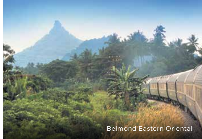
Belmond Eastern Oriental