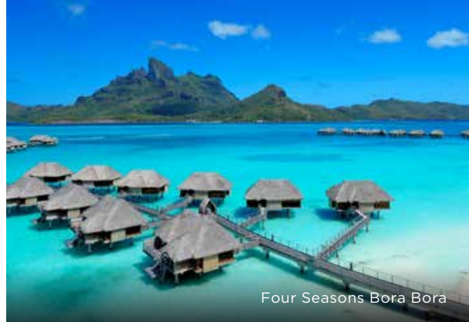
Four Seasons Bora Bora