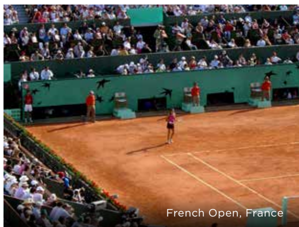
French Open, France

Tennis...Paris...late May...perfect! It's the French Open, the second of the four great Grand Slam tournaments, and for many, the ultimate tennis championship. With spectacular tennis guaranteed, luxuriate in one of the world's most beautiful, romantic cities at its sweetest. And oh, the shopping...from the luxury jewelers on Place Vendome and top designers on Rue Saint Honore, to Sunday shopping in The Marais. Tips: Lemaire in the 3rd is a red-hot fashion destination. Where to stay: Mandarin Oriental or Peninsula .