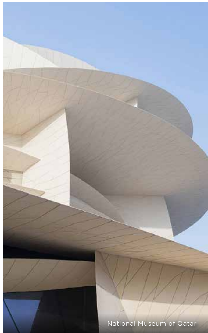
National Museum of Qatar

Located in the Jing’an district of Shanghai, not far from the PuLi Hotel, the building is a meticulous restoration of an early 20th century Asian baron’s European-influenced home. The fine tile work, ornately carved wooden staircases and exceptionally beautiful rooms and floors will inspire you as much as the current exhibition.