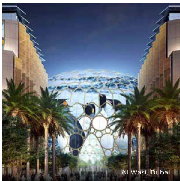
Al Wasi, Dubai

Thinking about Dubai? Add it to your travel plans because next year Dubai is hosting Expo 2020. Expect to be astonished by pavilions and exhibitions of at least 150 countries all centered around Al Wasl, a magnificent plaza partially enclosed by a massive dome that doubles as a 360° projection screen. With a theme of “Connecting Minds, Connecting the Future,” and main pavilions addressing sustainability, mobility and opportunity, Expo 2020 is an inspirational vacation. With Dubai, a global leader in solar power, expect to witness major green innovations. Counteract it with the other Dubai experience - luxury oceanfront resorts and exceptional dining and shopping. Where to stay: Four Season Jumeirah Beach or Mandarin Oriental .