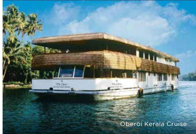
Oberoi Kerala Cruise