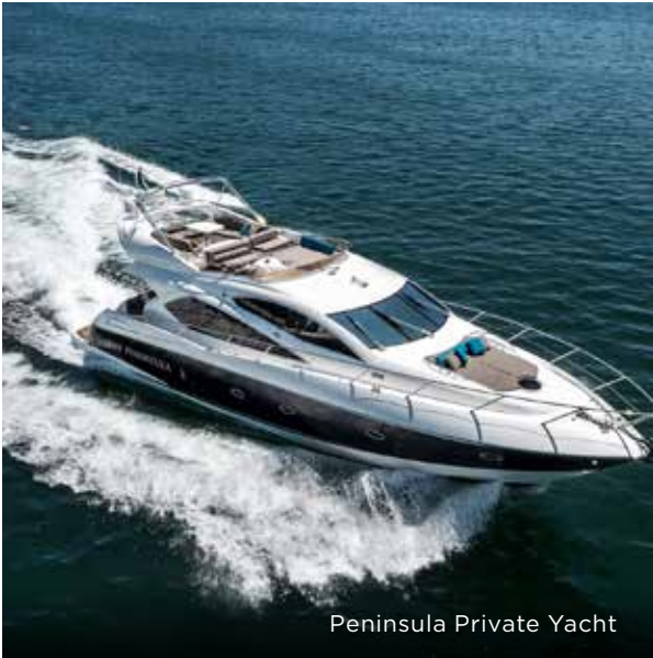
Peninsula Private Yacht

the evening, a private “symphony of lights” cruise with canapes, champagne and fine wines . Seeing Hong Kong from the harbor will definitely be a trip high point. A plus – you don’t have to be a Peninsula guest to book a Peninsula yachting adventure.